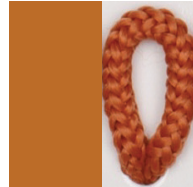
TERRACOTTA - TER Pant. 153C 205