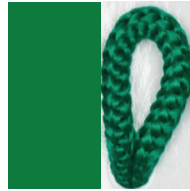
JUNGLA Pant. 356C 310