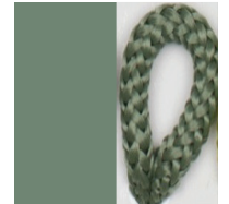
OLIVE - OLV Pant. 5625C 323