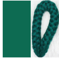
VERDE OSC. Pant. 3298C 358