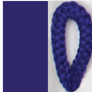
LAPIZLAZULI Pant. 2745C 62