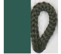
DARK GREEN - DGN Pant. 5616C 301