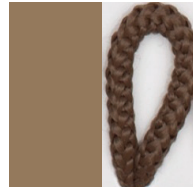
MOCHA - MOC Pant. 7504C 175